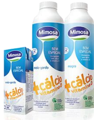
Skimmed and Semi-skimmed milk