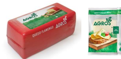
Bar and sliced