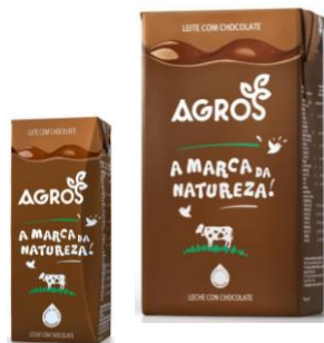
200ml and 1L chocolate milk