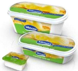
With salt 10g, 125g, 250g