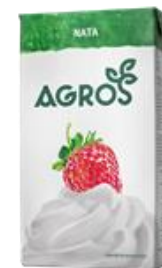
1L double cream