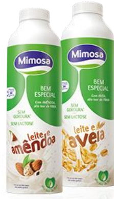
Semi-skimmed milk with almond and oats