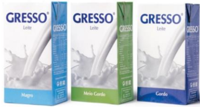
Skimmed, Semi-skimmed, Whole milk