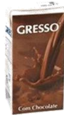
200 ml chocolate milk