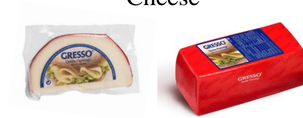
Quarter and bar