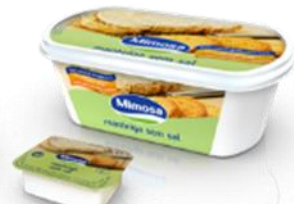
Without salt 10, 250g