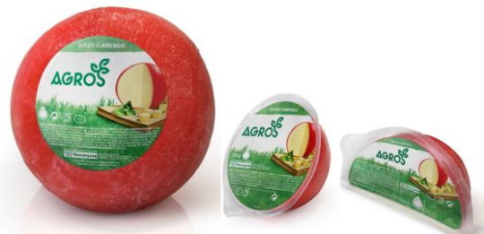
Whole, half, quarter