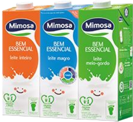
Skimmed, Semi-skimmed, Whole milk