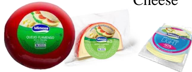
Whole cheese, half, quarter