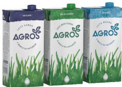
Skimmed, Semi-skimmed, Whole milk