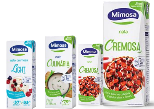
Single cream: light, creamy