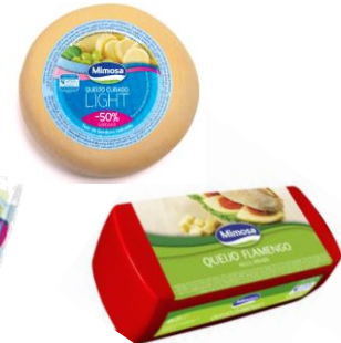
Light, Bar, sliced